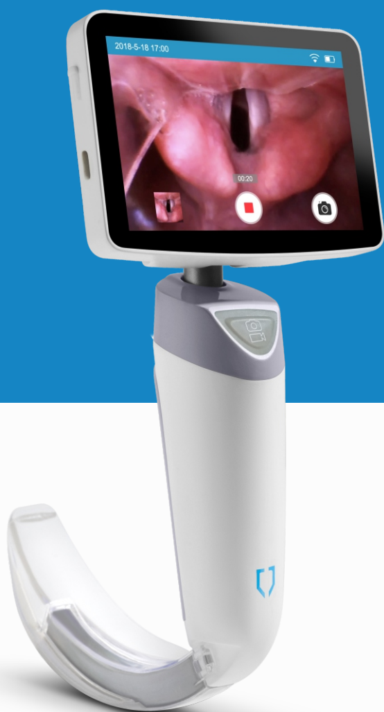
Video Laryngoscope VS-10 H